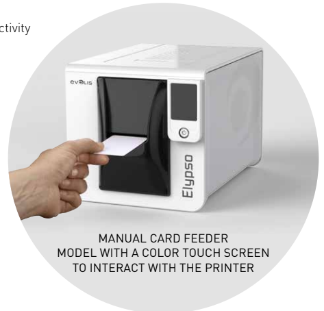
MANUAL CARD FEEDER MODEL WITH A COLOR TOUCH SCREEN TO INTERACT WITH THE PRINTER