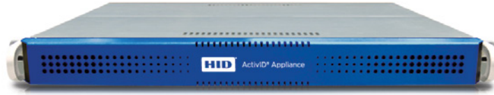
ActivID® Authentication Appliance