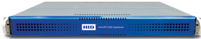
ActivID® Credential Management System Appliance